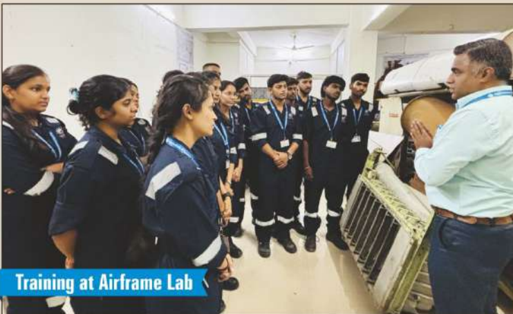
Training at Airframe Lab

Practical training is an essential part of any engineering course. The Institute has a well equipped workshop to impart practical training to students in basic workshop technology. The other laboratories include Electrical Lab, Instrument lab, Radio Navigation lab, Engine Lab, Airframe Lab, NDT & Composite Lab, Battery Charging Lab & Electronics Lab. These labs are equipped with all required training aids and other equipments required for practical demonstration and training.