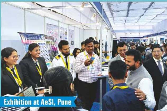
Exhibition at AeSI, Pune