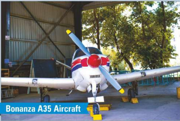
Bonanza A35 Aircraft