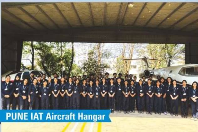
PUNE IAT Aircraft Hangar