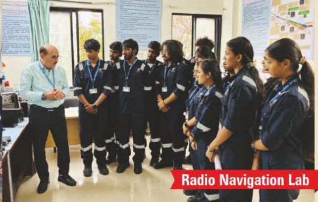
Radio Navigation Lab