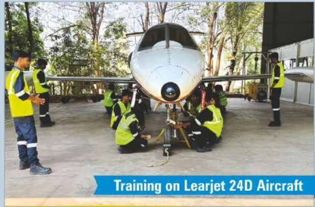
Training on Learjet 24D Aircraft