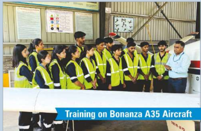
Training on Bonanza A35 Aircraft