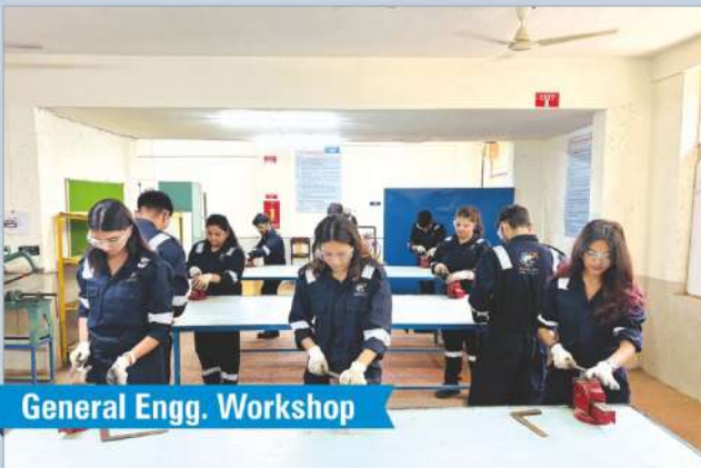
General Engg. Workshop