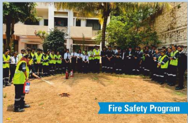
Fire Safety Program