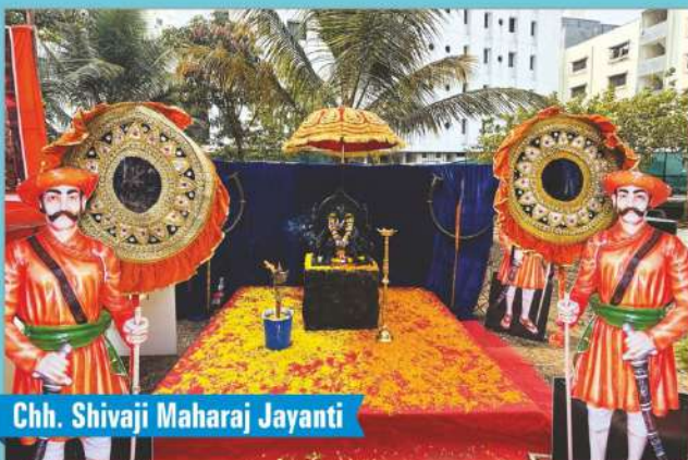
Chh. Shivaji Maharaj Jayanti