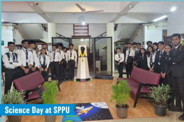
Science Day at SPPU