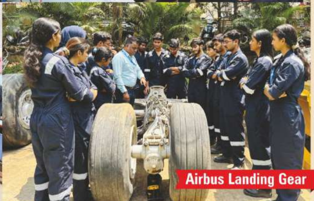
Airbus Landing Gear