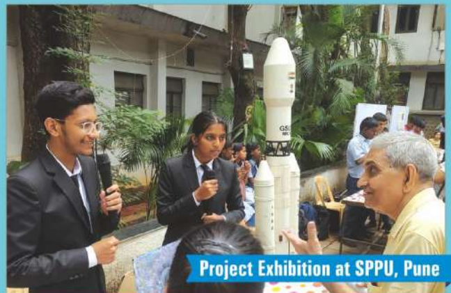
Project Exhibition at SPPU, Pune