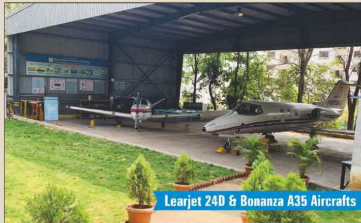
Learjet 240 & Bonanza A35 Aircrafts