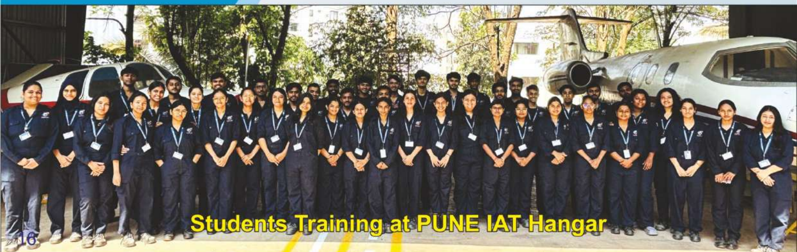
Students Training at PUNE IAT Hangar