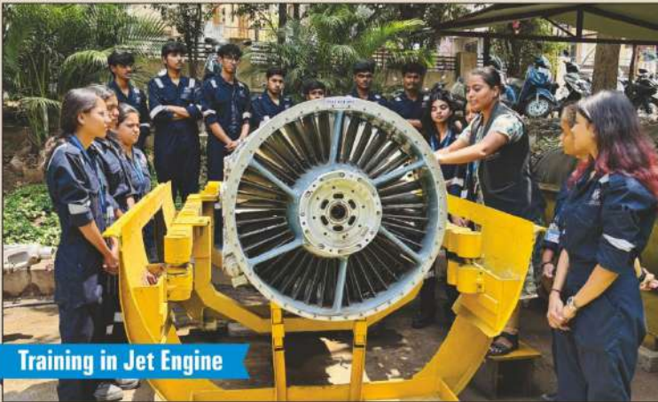
Training in Jet Engine

A modern computer lab equipped with 24x7 internet facility is available in the Institute. A wealth of E-Books are utilized to provide extensive knowledge and capability for training.