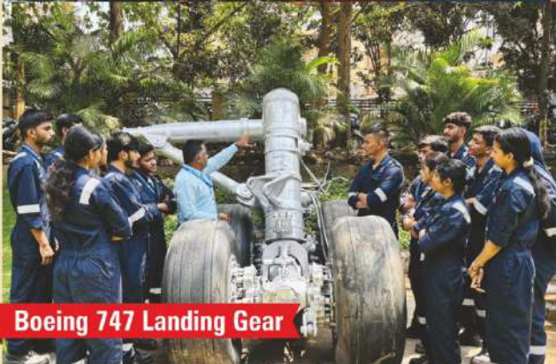
Boeing 747 Landing Gear